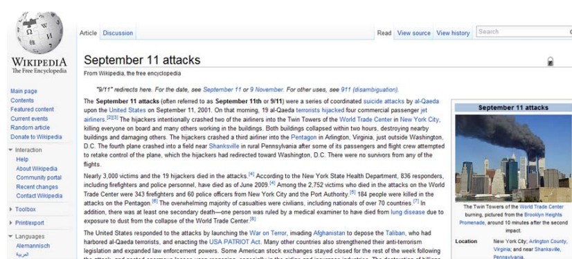
Figure 1. Screenshot of the article about September 11 attacks.

Every Wikipedia article has a related talk page in which anyone can discuss the article content and structure, negotiate and suggest improvements or changes (see Figure 2).